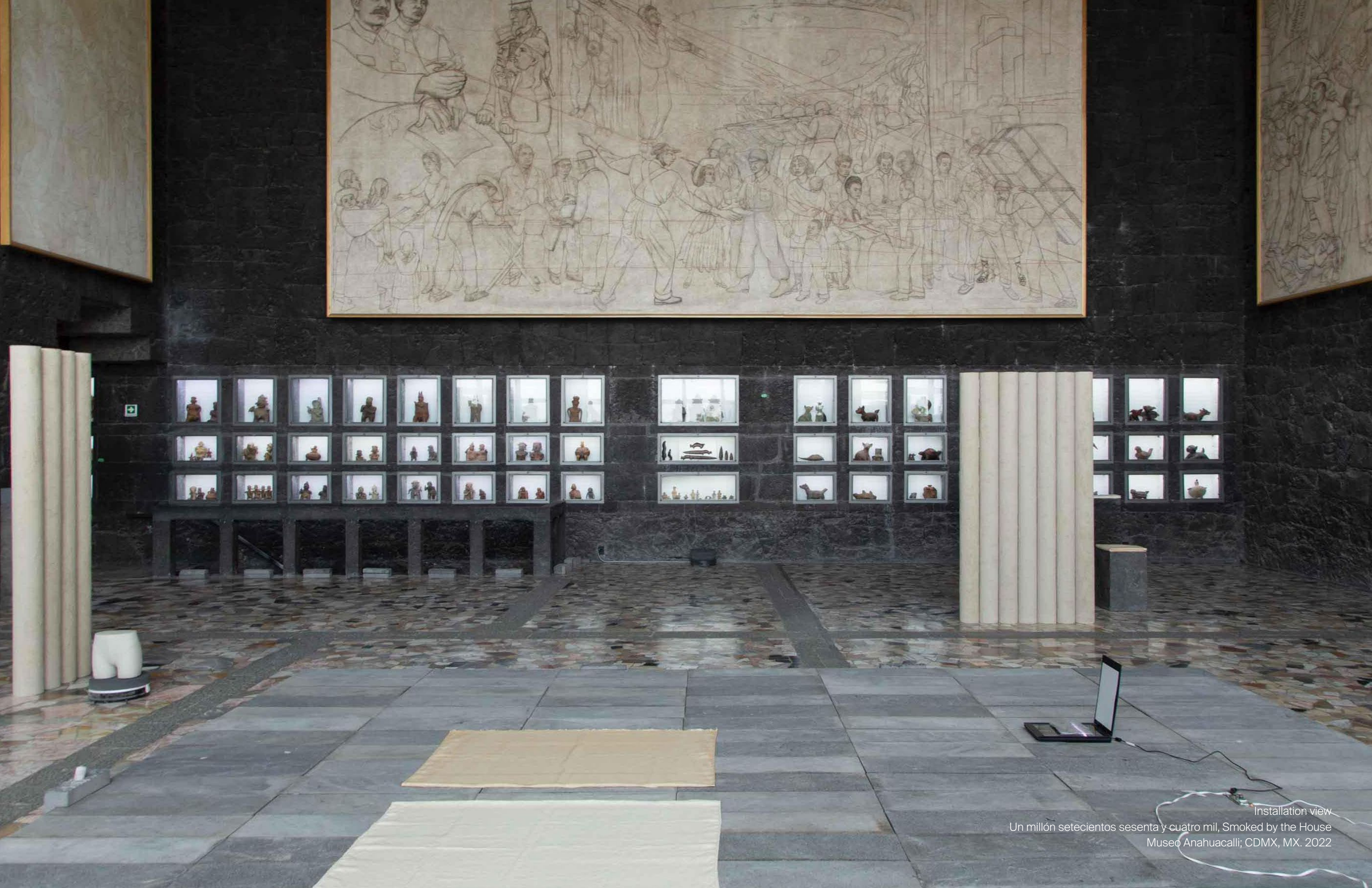
Installation view Un millón setecientos sesenta y cuatro mil, Smoked by the House Museo Anahuacalli; CDMX, MX. 2022