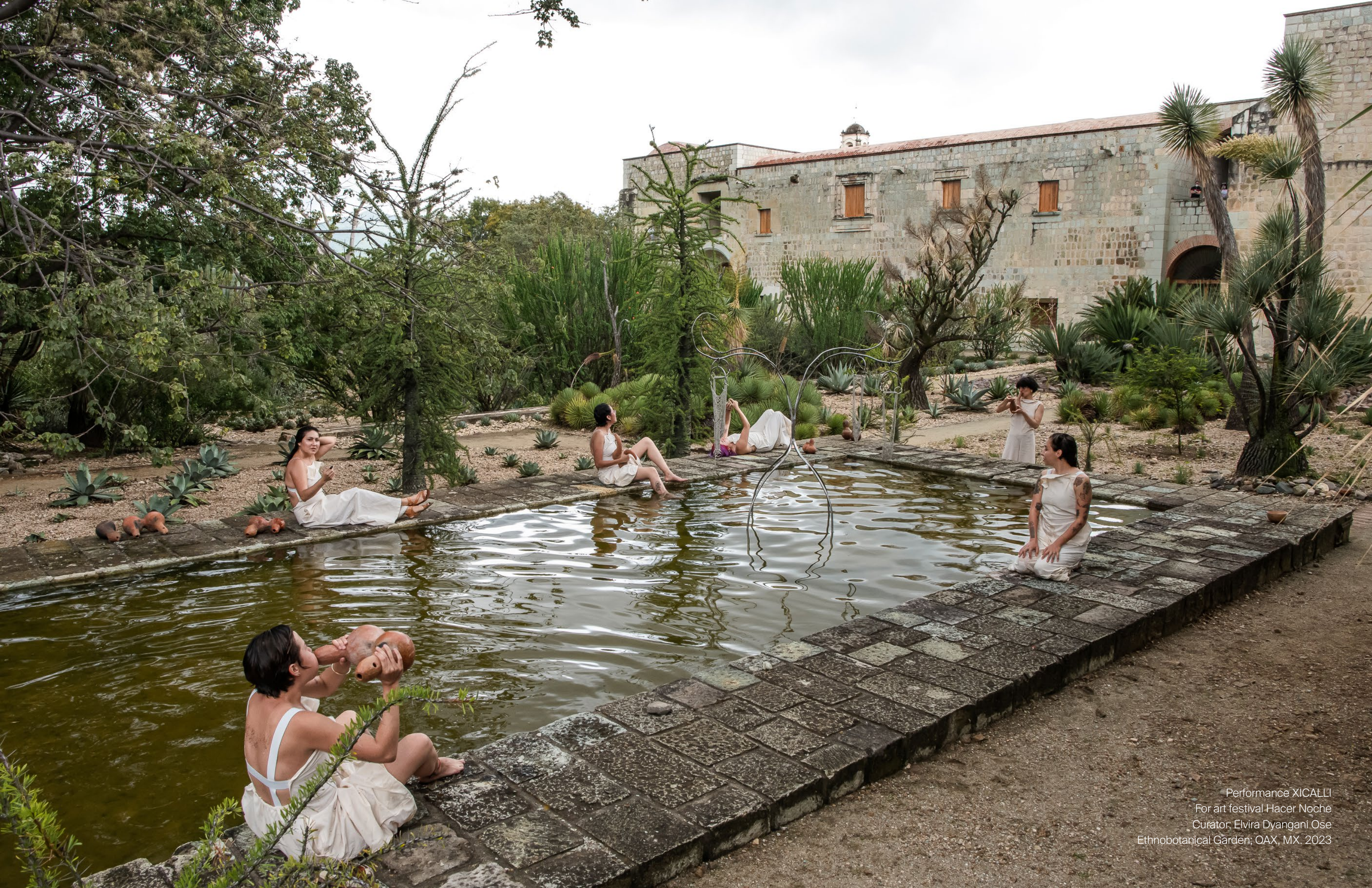
Performance XICALLI For art festival Hacer Noche Curator: Elvira Dyangani Ose Ethnobotanical Garden; OAX, MX. 2023