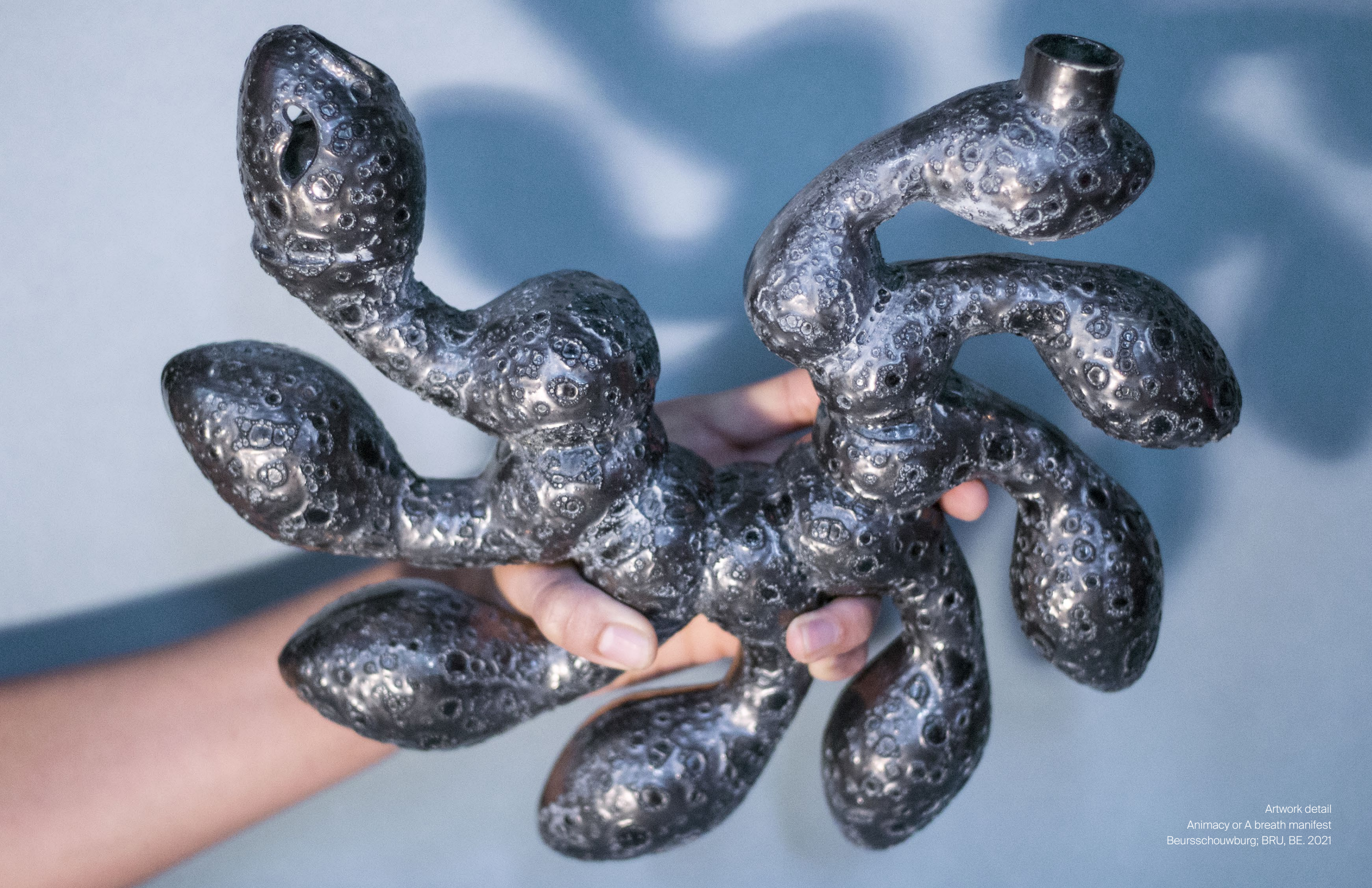
Artwork detail Animacy or A breath manifest Beursschouwburg; BRU, BE. 2021