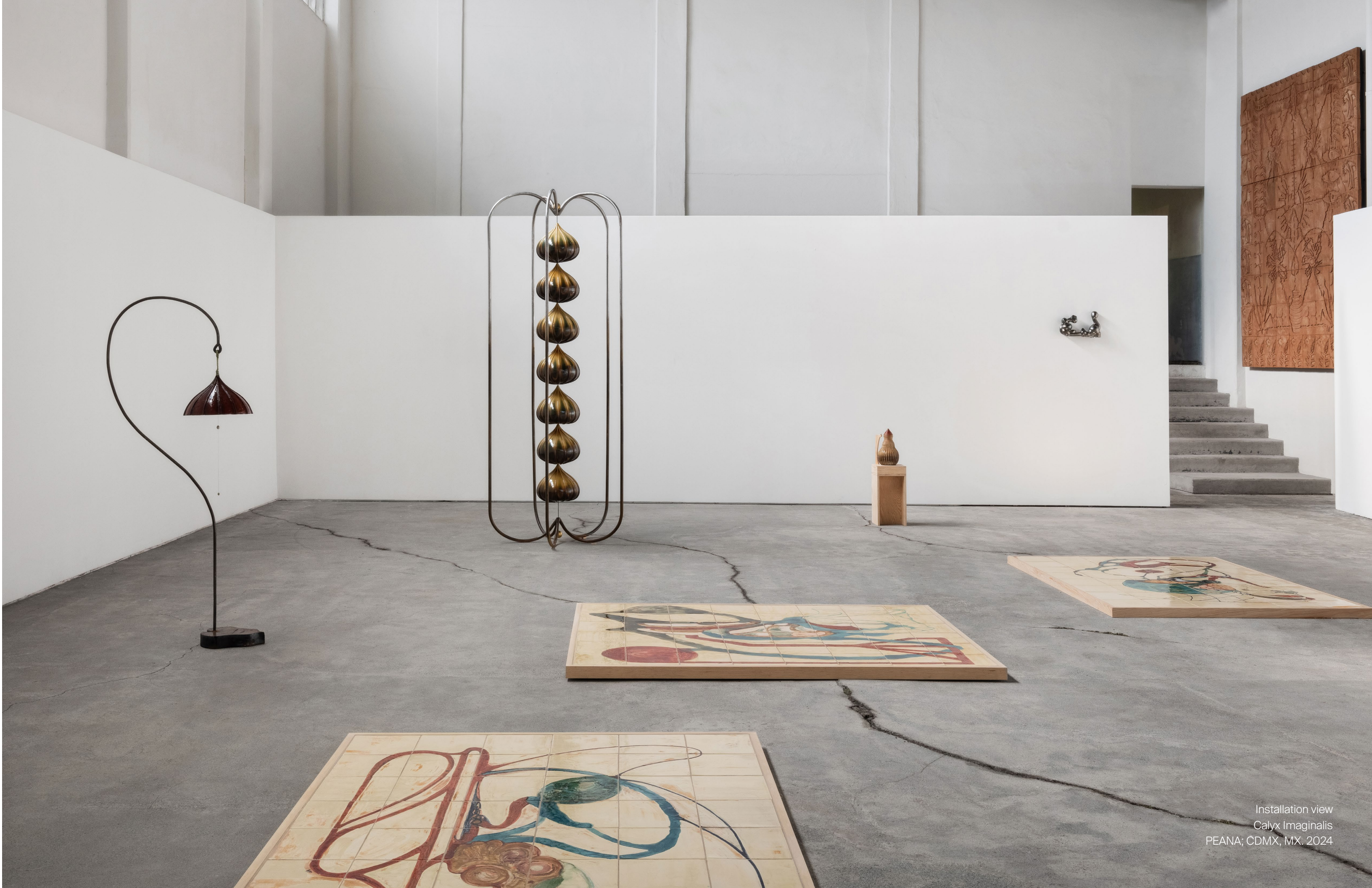
Installation view Calyx Imaginalis PEANA; CDMX, MX. 2024