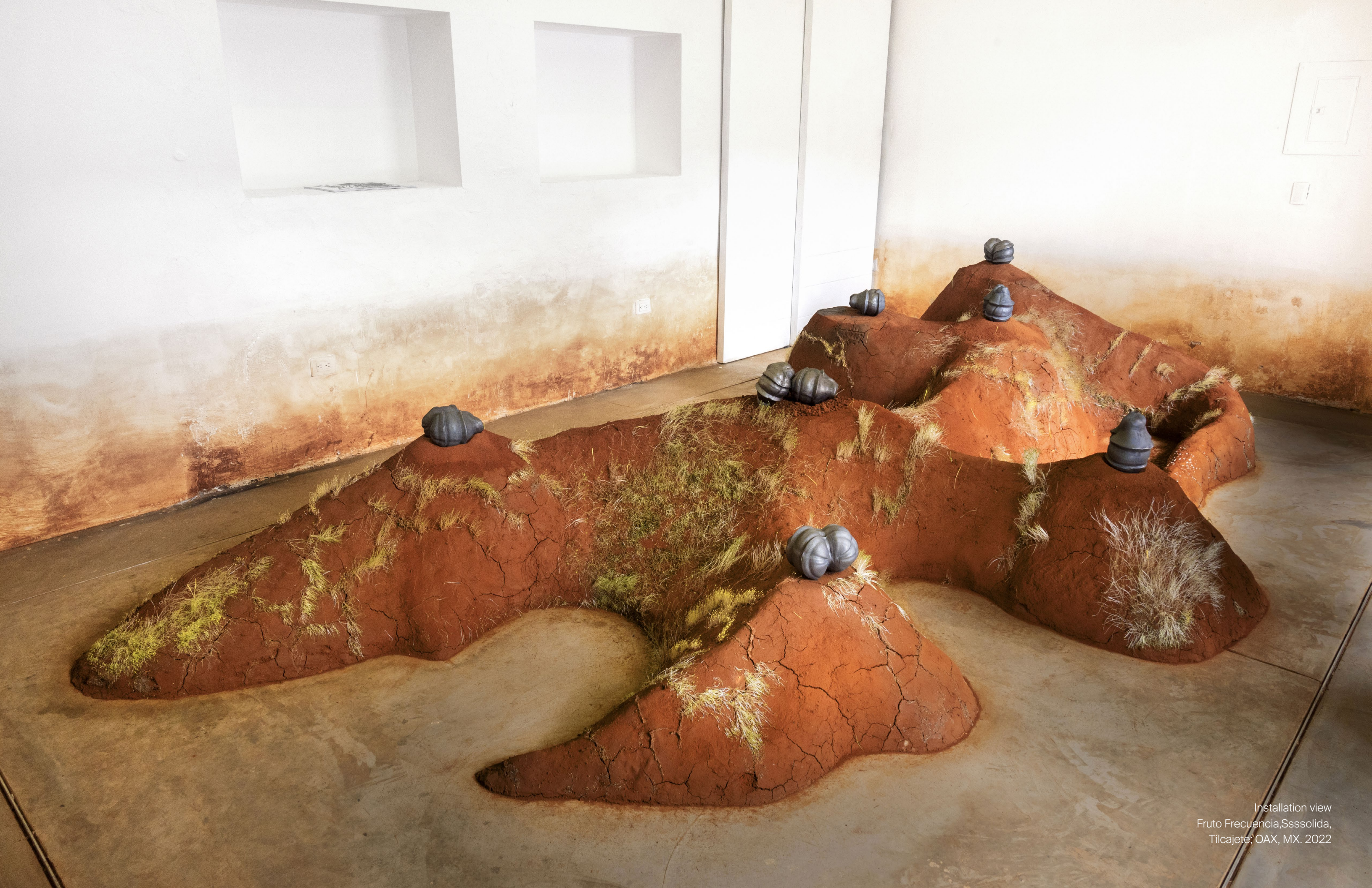
Installation view Fruto Frecuencia, Ssssólida, Tilcajete, OAX, MX. 2022