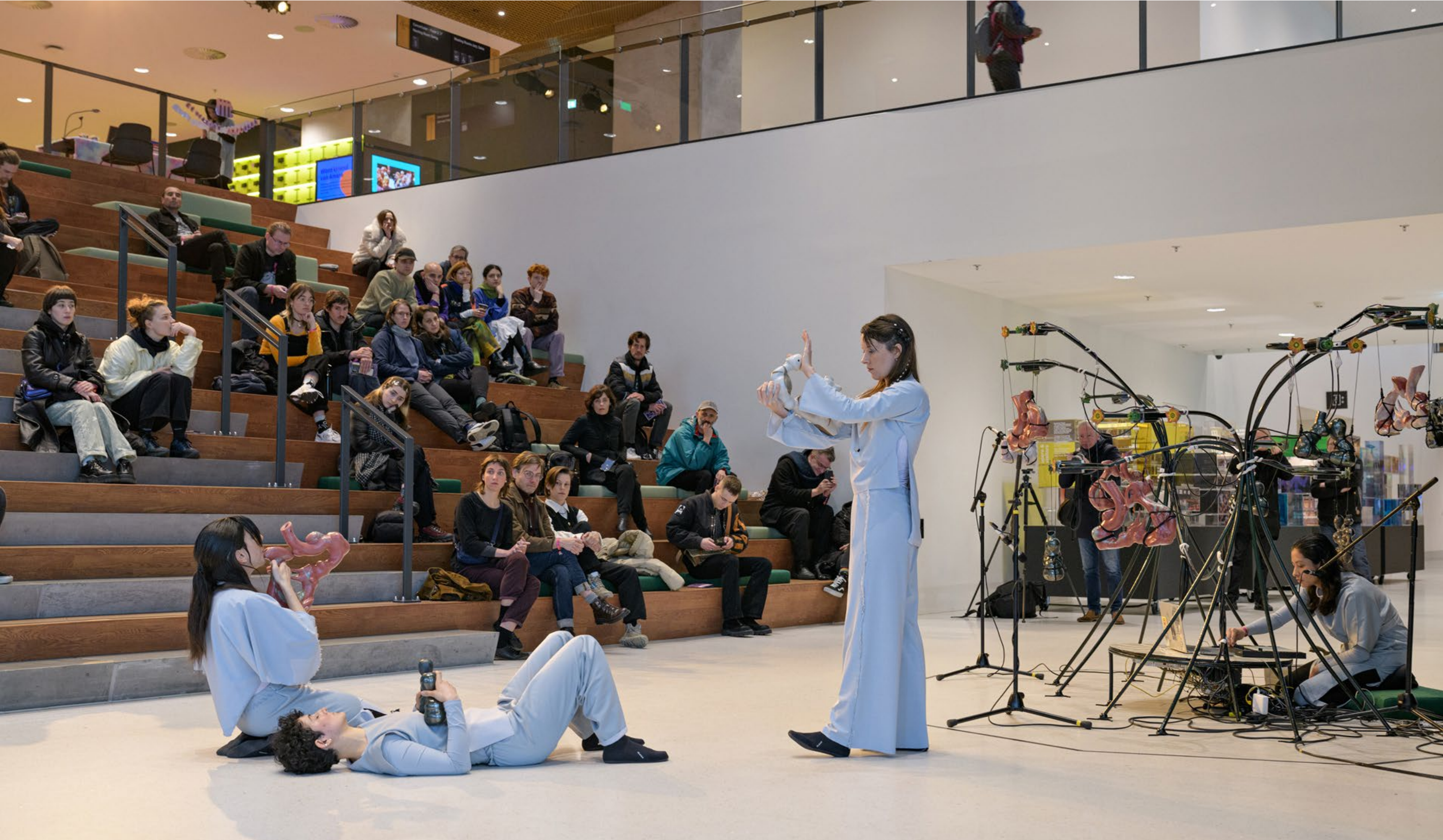
Performance Mitote and Ollin EKWC; OIS, NL, 2023