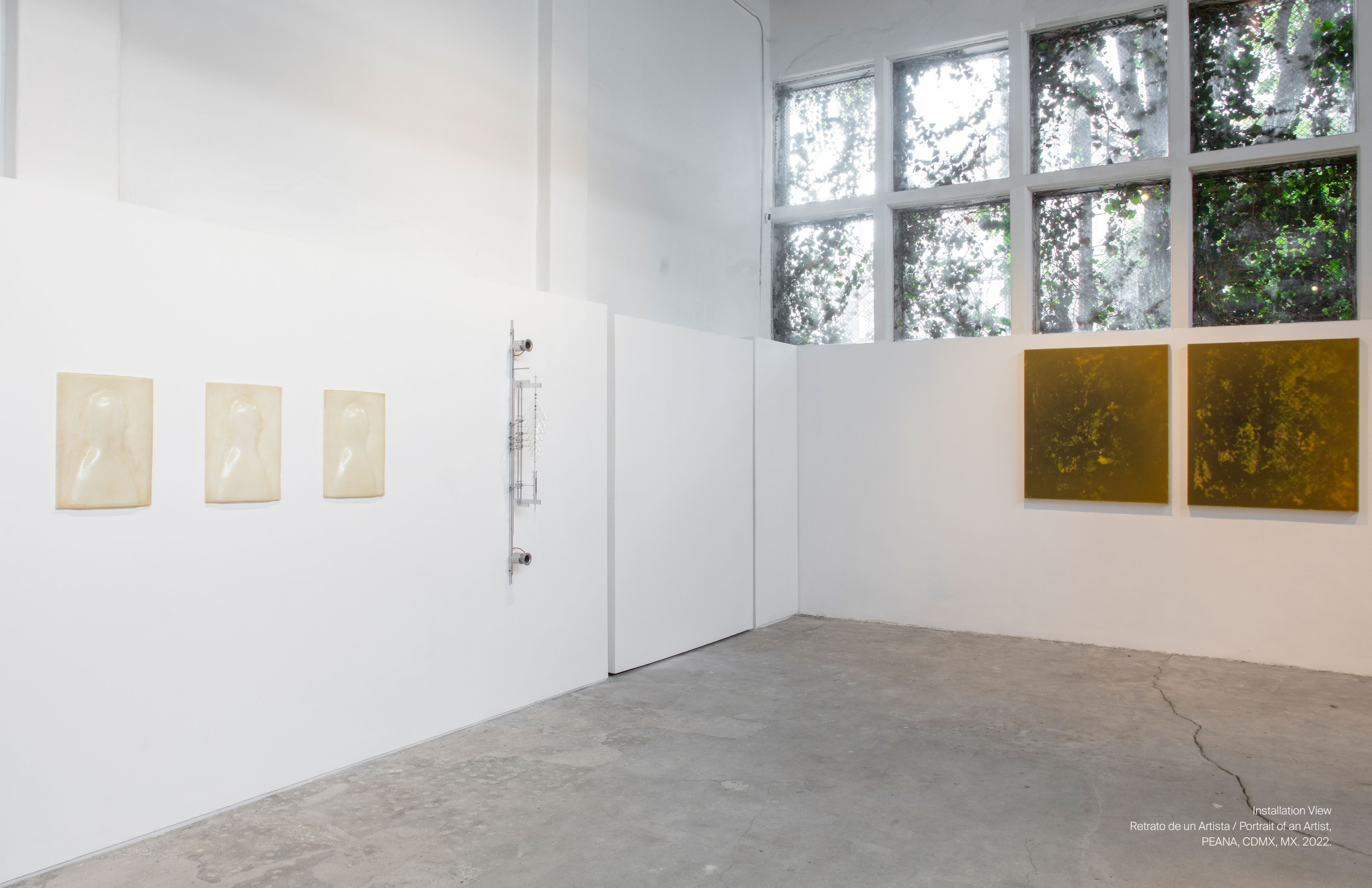
Installation View Retrato de un Artista / Portrait of an Artist, PEANA, CDMX, MX. 2022.