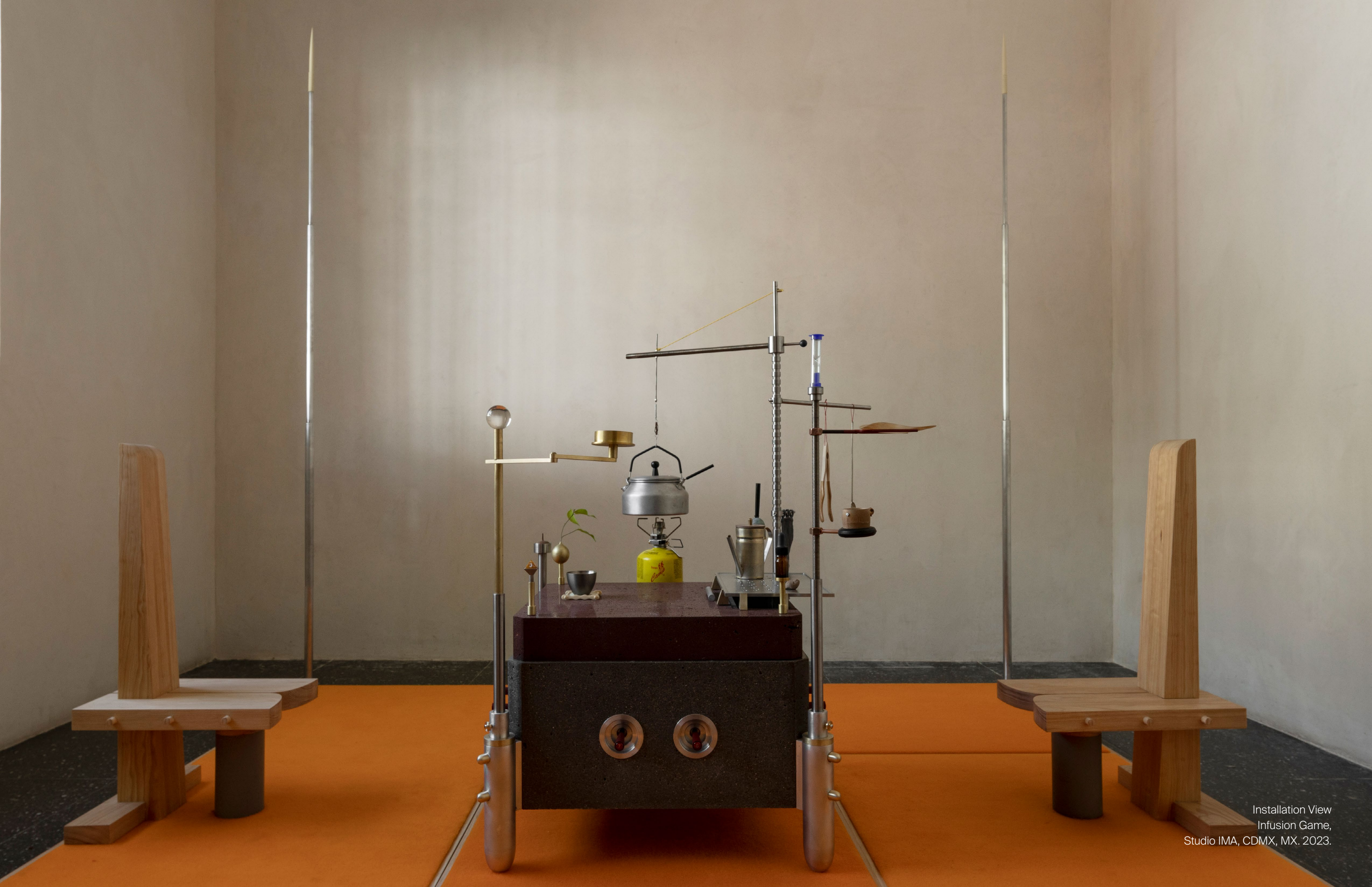
Installation View Infusion Game, Studio IMA, CDMX, MX. 2023.