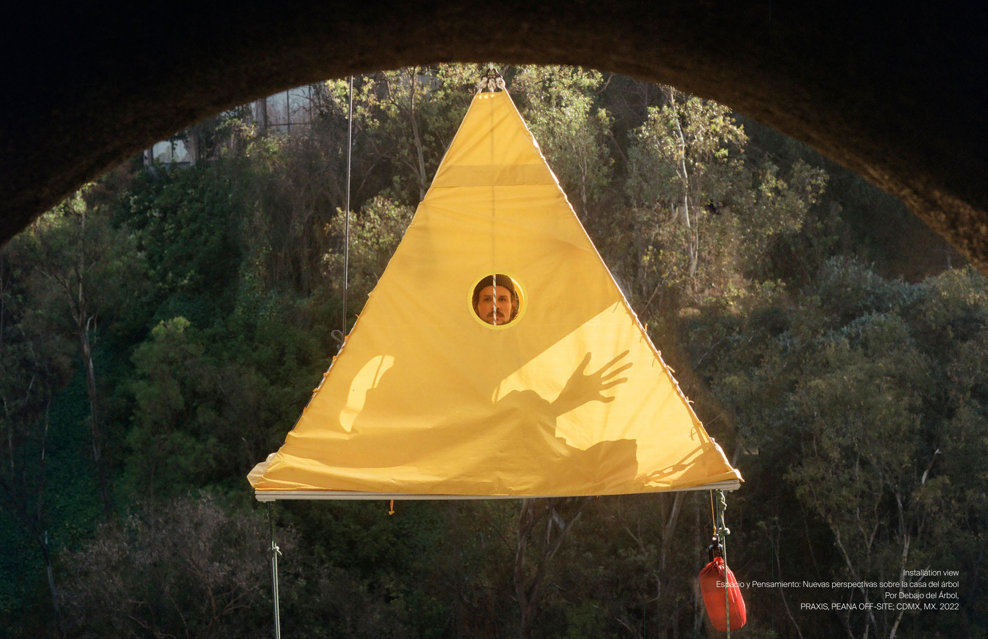
Installation view Espacio y Pensamiento: Nuevas perspectivas sobre la casa del árbol Por Debajo del Árbol, PRAXIS, PEANA OFF-SITE; CDMX, MX. 2022